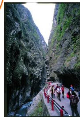
Scenic Areas of East Coast