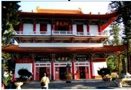
Sun Moon Lake Ci-en Pagoda