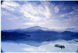
Wen Wu Temple