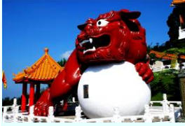
Sun Moon Lake Xuanzang Temple